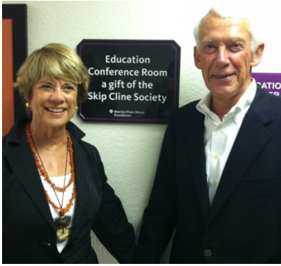
Education Conference Room