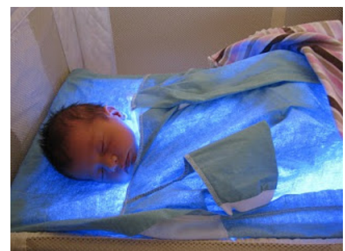
neoBLUE LED Phototherapy