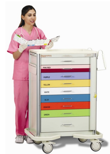
Broslow Color Coded Carts