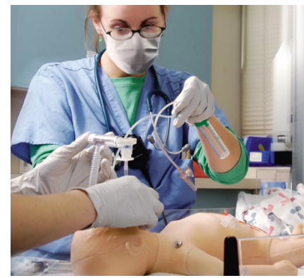
BabySIM and SimNewB

Over the past 10 years, members of the Skip Cline Society have helped advance the future of health care through philanthropy, while providing an active voice for the not-for-profit hospitals of Morton Plant Mease.